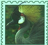
Crested Crane: Uganda's National Bird