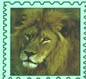
Lion: Lions can be seen in several national parks in Uganda