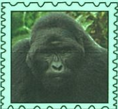
Mountain Gorilla: Uganda is home to over 50% of the world's mountain gorillas