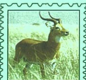
Uganda Kob: Uganda's National Animal